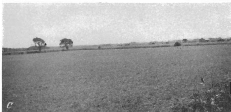
A, Recently mowed hayfield on Bernardston loam, level phase, with nursery stock in background. B, Cauliflower and spinach grown under irrigation on Bernardston loam, level phase. C, Characteristic level surface of the Warwick and Merrimac soils. Hayfield with silage corn in background on Warwick very fine sandy loam.