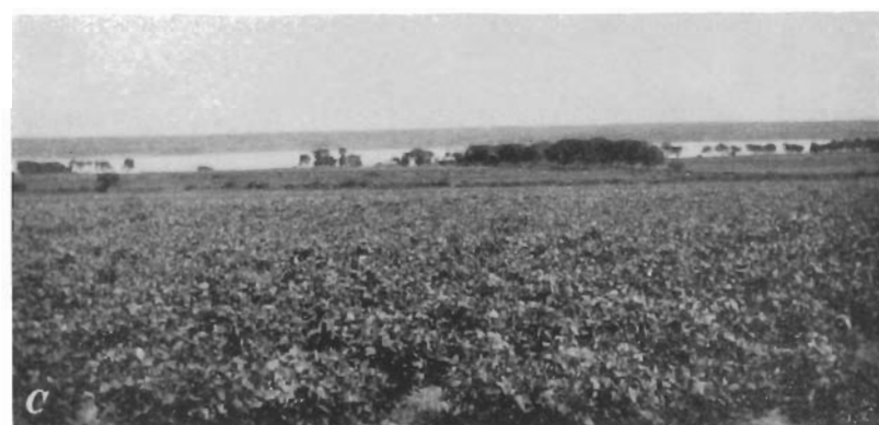
1. Characteristic relief of Newport loam; B, hayfield on Newport loam, level phase with silage corn in background; C, lima beans on Bernardson loam.