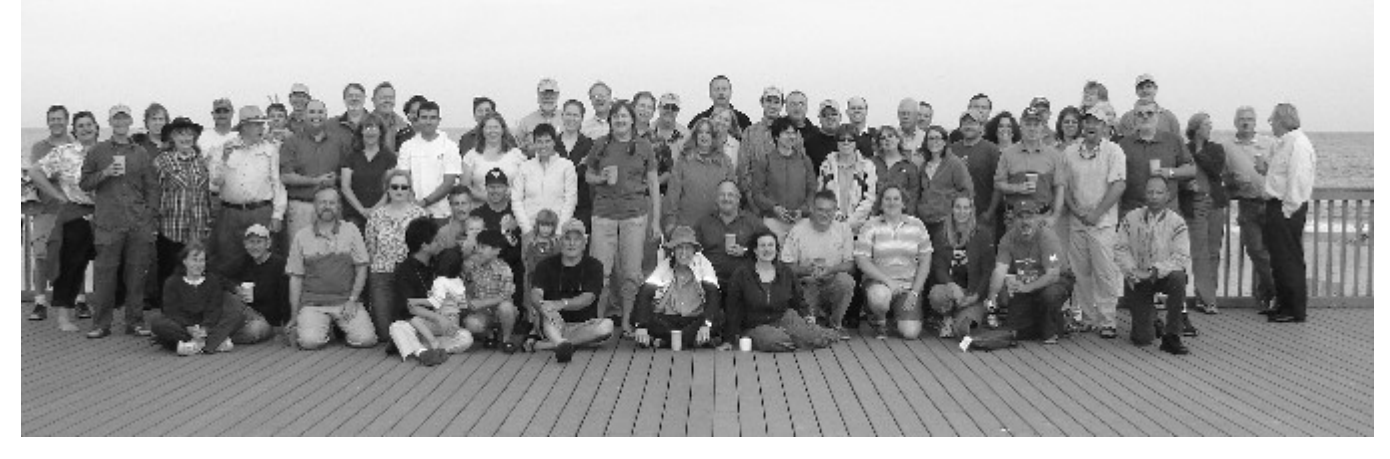
Photo: Top right: trench dug in outwash soils at Preston Plains. Bottom: participants of the conference at the social clam bake/lobster boil, Narragansett Pier Beach.